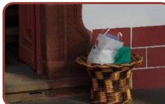
The basket at the door of the Chapel with some of the donations received over the last few weeks.

For the last several weeks we have been collecting donations of food, hygiene products and easter eggs to make up hampers for the families in our care.