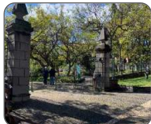
Santa Catarina Park in Funchal – Orange Walkathon – April 7 th 2024

Thank you again to all of you, and to our wonderful volunteers for making the world a little bit better for those in need.